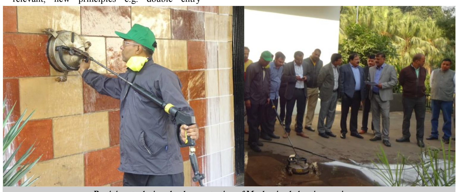
Participants during the demonstration of Mechanized cleaning equipment

Sanitary workers are not well aware about the Municipal Solid Waste Management Rules, guidelines of septage management & management of sewerage & drainage, for this Capacity building of municipal functionaries is essential. In this context, Regional Centre for Urban and Environmental Studies, Lucknow organized a three days advanced Training