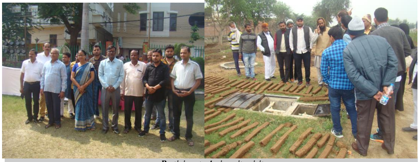
Participants during site visit

and liquid waste treatment models. The elected representatives had elaborate discussion with the practitioner. The Model House Park project of Lucknow was initiated by active participation of the citizens and ward member. This visit was a peer learning among the elected representatives which was very fruitful. The participants were also taken to a Bio Gas Digester Plant which is an innovative model of the state government for generating gas through treatment of animal shelter waste along with liquid waste at Kanha Upvan, Lucknow.