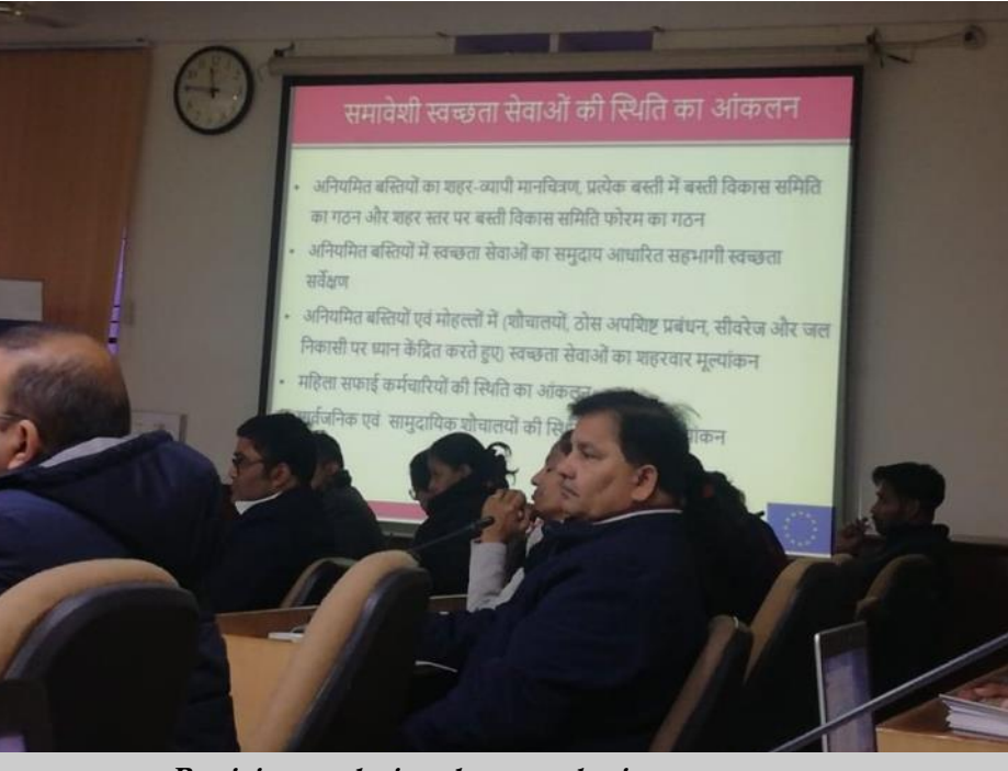
Participants during the consultation programme

appraise ULBs on methods for participatory planning and monitoring for inclusive sanitation services in the state.