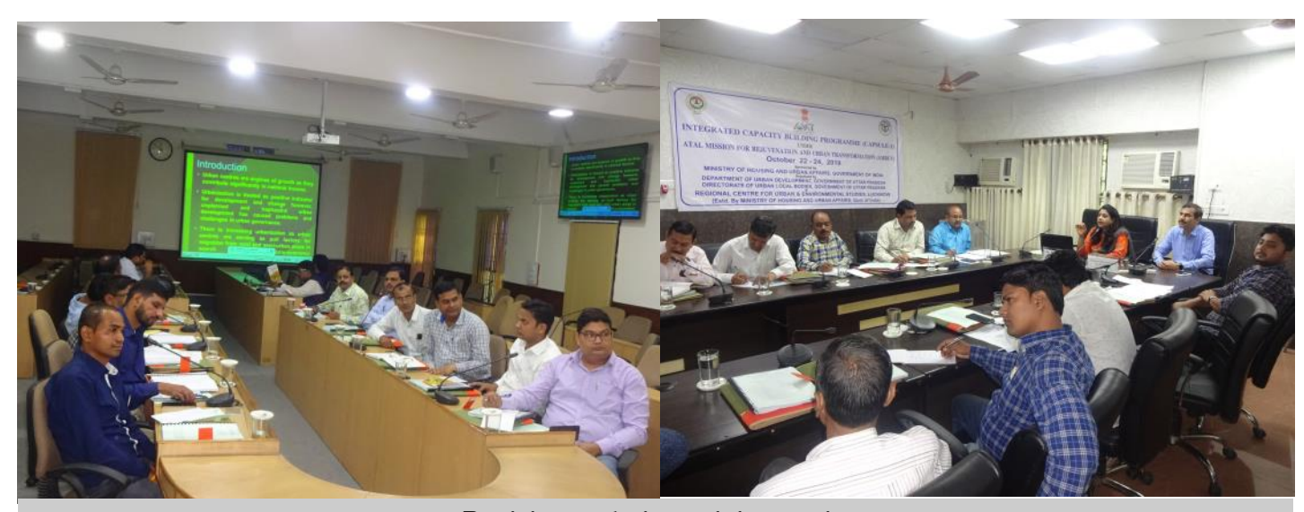
Participants during training session

Plan (SAAP), Funding Pattern, Capacity Building etc were carried out. The participants were briefed about the different missions/schemes of Ministry of Housing and Urban affairs (MoHUA) and their convergence.