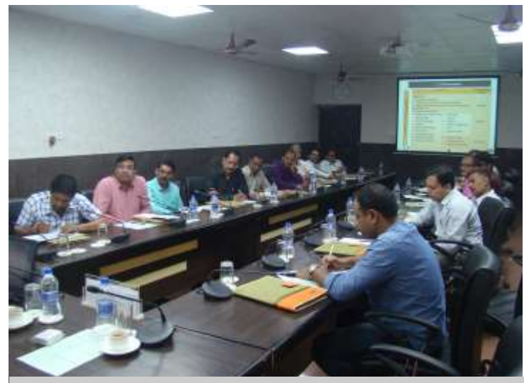
Participants during the training sessions