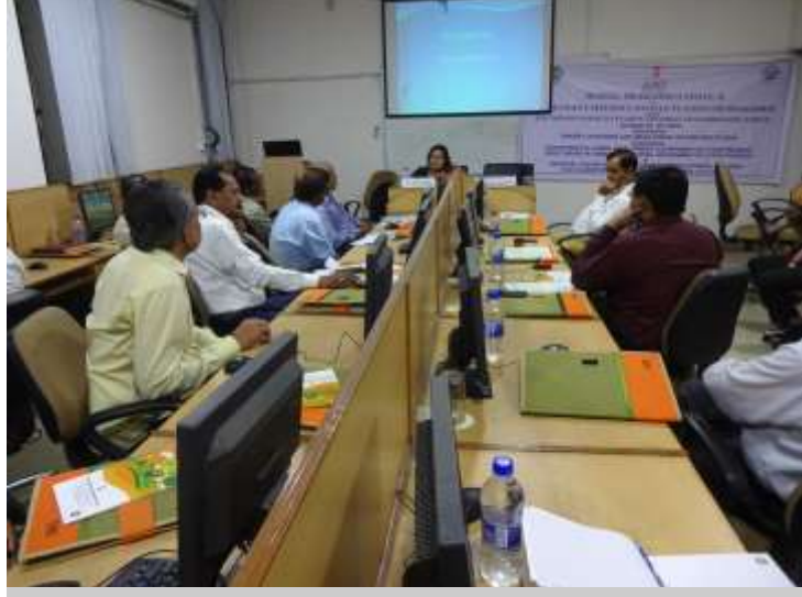
Participants during the training sessions

local governments and ensuring effective delivery of services, particularly to the urban poor;