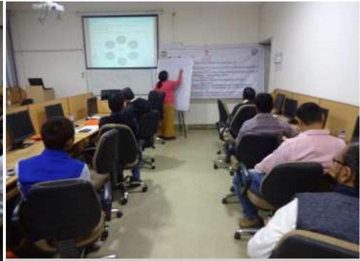
Participants during the training sessions

The course contents included Enhancing Administrative Efficiency in ULBs ; Strategy and Action Plan for Implementation of Management; Reforms: Modern Office Database management system, MS Suite and IT Applications; Improving Municipal Services Delivery through Smart Applications; E-Tendering & its Procedures; Application of IT for Enhancing Service Delivery in ULBs; Project Management System under AMRUT: Hands on Training of online Data Updation on E-nagarsewa, m-AMRUT App. & Online AMRUT Portal: E-governance and its Application in ULBs.; Budgeting principles and practices in ULBs; Asset/liability Management in Urban Local Bodies; Tax compliance and filling of Returns; RTI and its Legal Compliances; Code of Conduct & Disciplinary Rules; Record Keeping & Management; Store procurements; Travelling Allowance Rules and