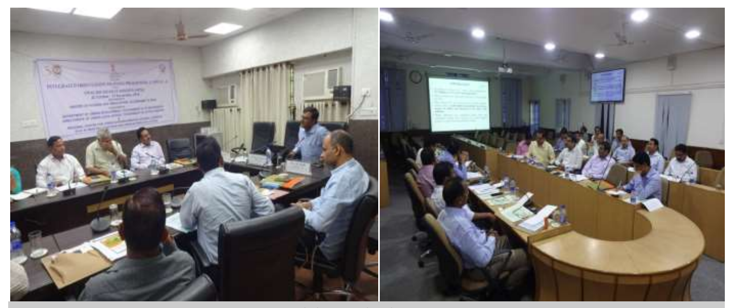
Training session in progress

The training programmes were designed to give basic knowledge of various programmes/ missions of Govt. of India to the participants, with focus on Swachh Bharat Mission. Detailed presentations were made by the internal and external faculty and enough time was devoted for discussions and problem solving. The topics covered during the programme included: Key Issues and Challenges related to SBM. Participants were introduced to the objectives, guidelines and processes of SBM. Need, Importance and Way Forward in the sphere of Solid Waste Management was discussed along with the learnings from the De-Centralized Waste Management Model of Ambikapur. Emphasis on