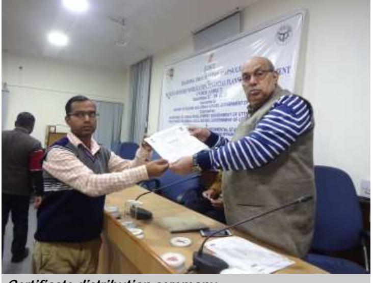
Certificate distribution ceremony

allowed to enjoy fiscal autonomy with freedom of choice in regard to imposing new taxes and revising tax rates. It is argued that municipal bodies are not financially strong enough to tap capital market for undertaking infrastructure works which involve huge capital investment, long gestation period. But the provision of marketing borrowing will certainly motivate the municipal bodies to revamp their financial strength to mobilize resources from market. There is also need to encourage private sector involvement in the development, strengthening and creator of urban infrastructure. Regional Centre for Urban and Environmental Studies, Lucknow organised a three days Training Training Programme Programme on on Resource Mobilisation, Financial Planning and Management under Capsule II under AMRUT, on 27-29 December, 2018 at RCUES, Lucknow. KEY OBJECTIVES :