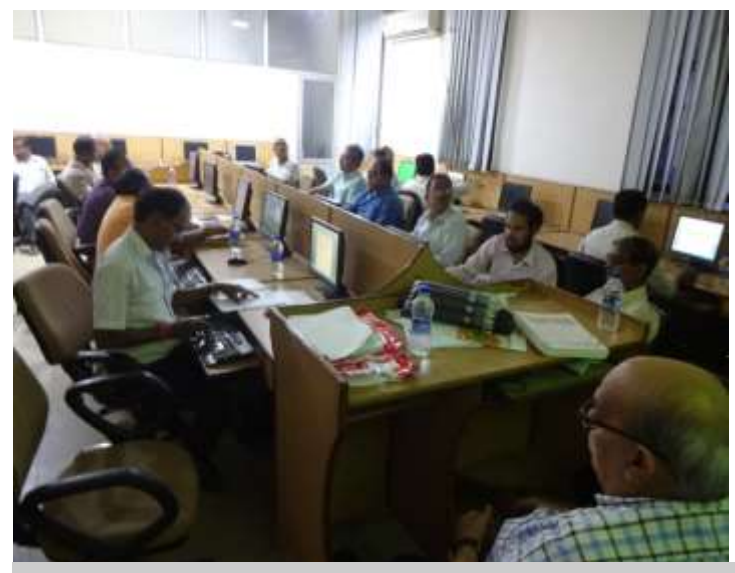
Computer Training session in progress

To orient the municipal staff on preparation of