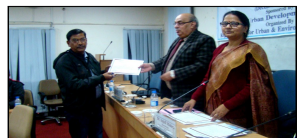
Certificate distribution to the participants