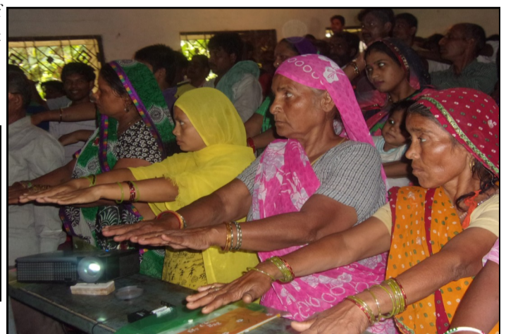
Street Vendor Training in progress

The Center organized three, two days training programmes for Urban Street Vendors at Aligarh under NULM. The main objectives of the Training Programme were: to orient urban street vendors regarding rules and regulations of Street Vendors Act; financial inclusion and urban development programmes and other social security schemes of the State government for Street vendors. Over all 1200 Registered Street Vendors were identified by Municipal Corporation out of which 727 Street Vendors were provided orientation training.