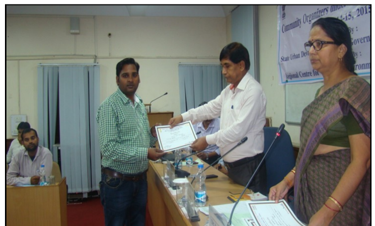
Certificate distribution to the participants