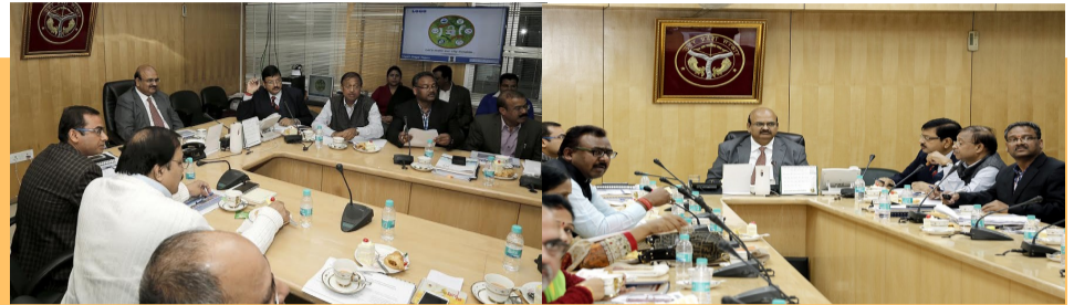
State Level High Power Steering Committee Meeting formed under the chairmanship of Chief Secretary, Govt. of Uttar Pradesh under AMRUT Mission