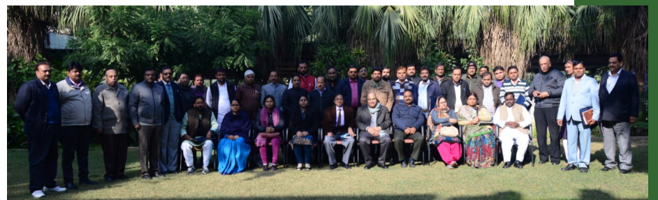
Participants & Faculty of the CCBP Workshop on 23rd December, 2014