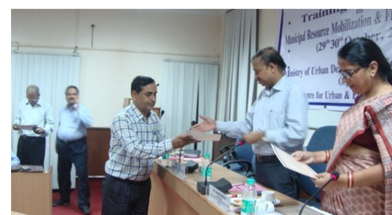
Certificate distribution to the participants