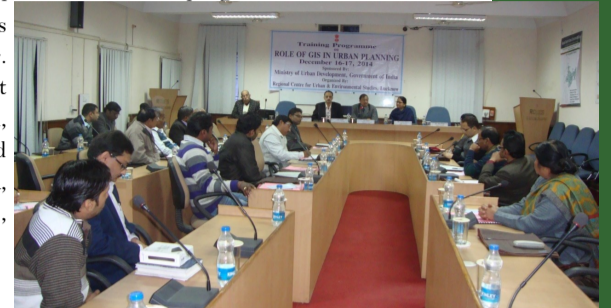
Participants & Faculty of the Training Programme