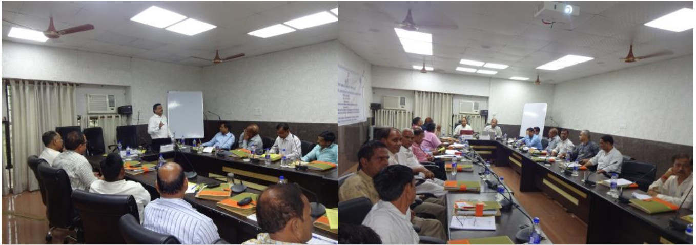
Participants during the training sessions

Cap. III under AMRUT at RCUES Lucknow on 22-24 July 2019, 26-28 August 2019 and 29-31 August 2019