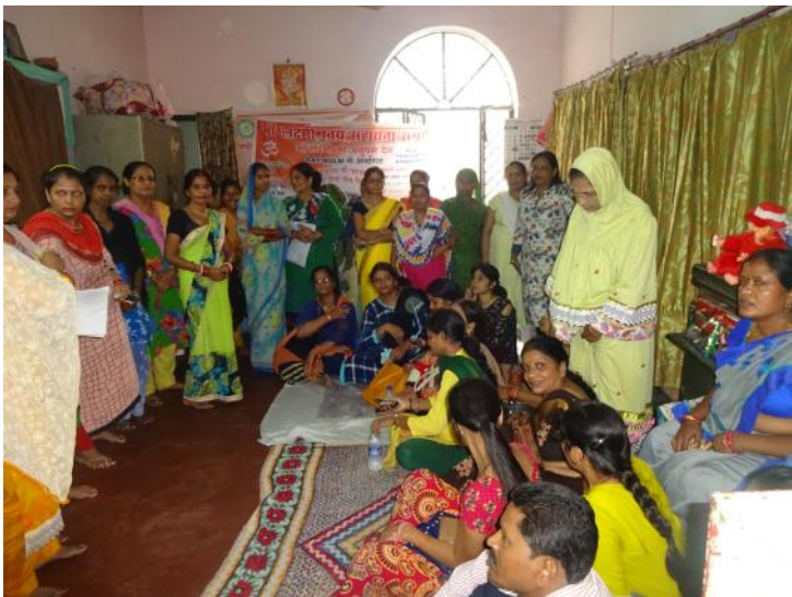
Participants during site visit to SHG at Alambagh, Lucknow