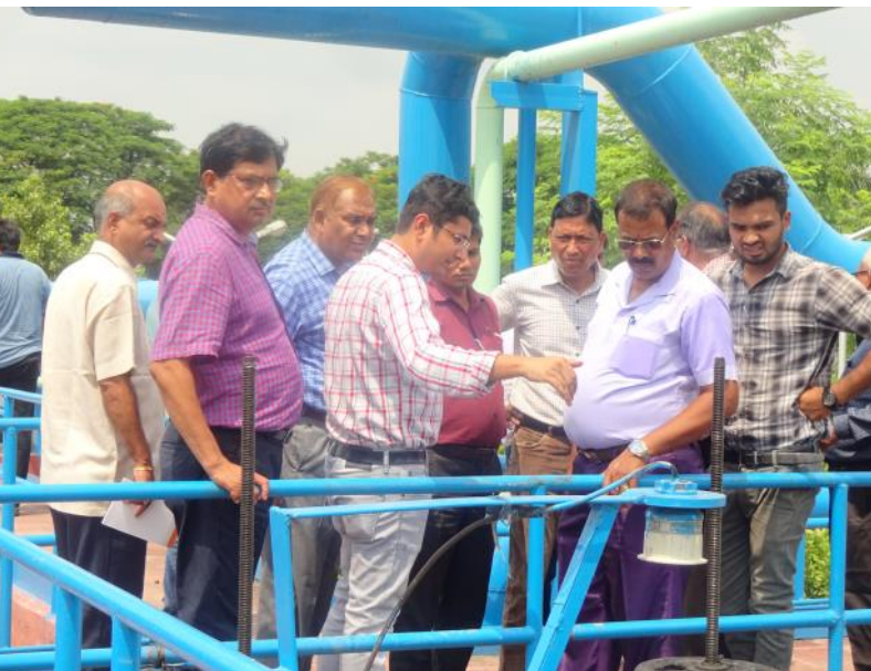
Participants during site visit