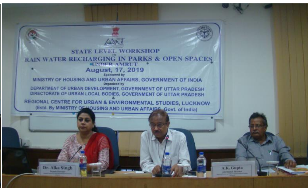
Day of the State Level Workshop