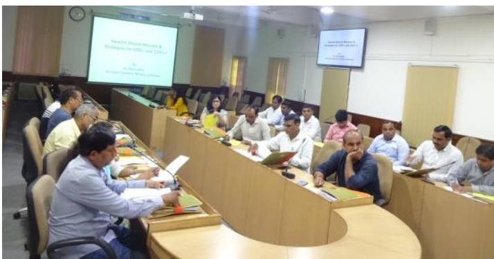
Participants during the sessions

Sanitation in India is a state subject. Urban Local Bodies are responsible for sanitation at the local level. ULBs are mandated to undertake planning, design, implementation, operation and maintenance of water supply and sanitation