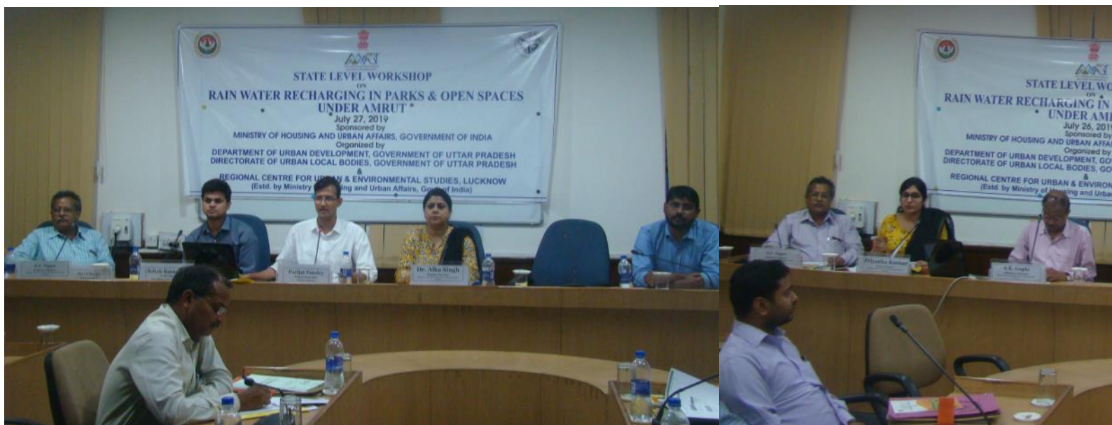
Introductory sessions on each day

Keeping in view the importance of the above