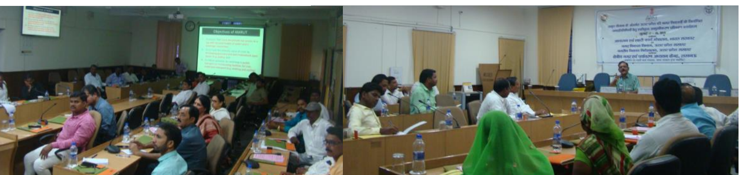
Participants during the sessions

Reforms in urban sector are an important aspect which was discussed during the training.