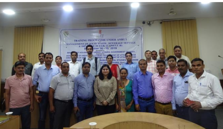
Participants along with the Faculty members of RCUES Lucknow