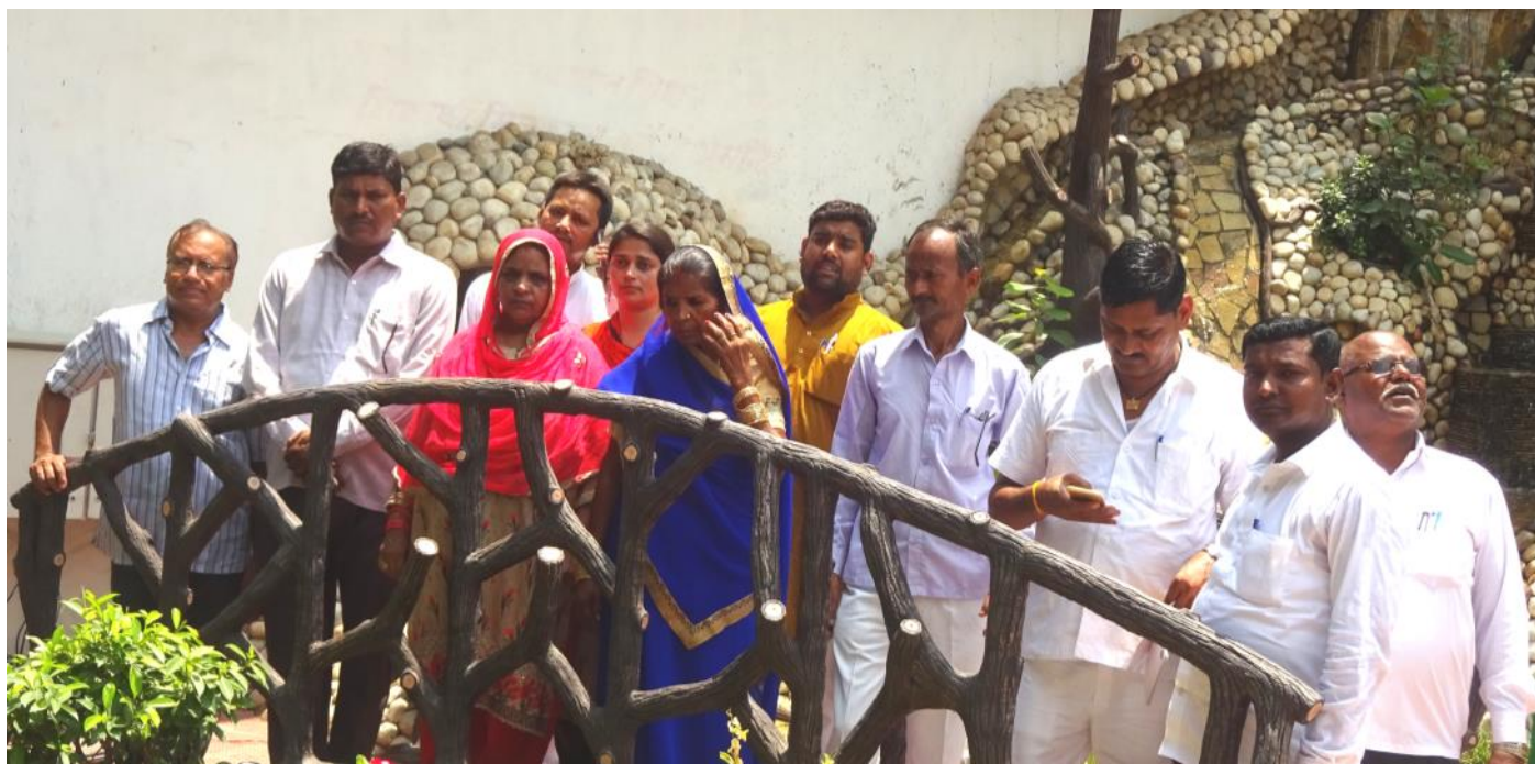
Participants during site visit

elected representatives. With the objective of sharing and learning from good practices for