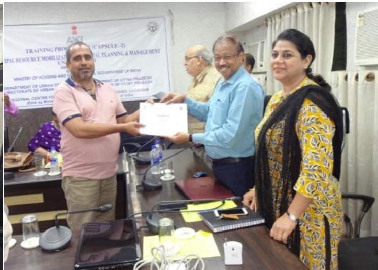
Participants during the sessions

Management under AMRUT Capsule II, on 25-27 July 2019 and 29-30 July 2019 at RCUES, Lucknow.