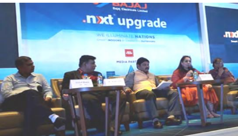
Panelists of the Seminar on Lighting 2025 and Beyond

distilleries was held on 11 August 2019 in New Delhi by the institution of Water and Environment in collaboration with India Glycols. Attended by more than 150 stakeholders from government, industry, academics and consulting, the conference was inaugurated by UP Singh IAS, Secretary for Water Resources & Ganga Rejuvenation GOI.