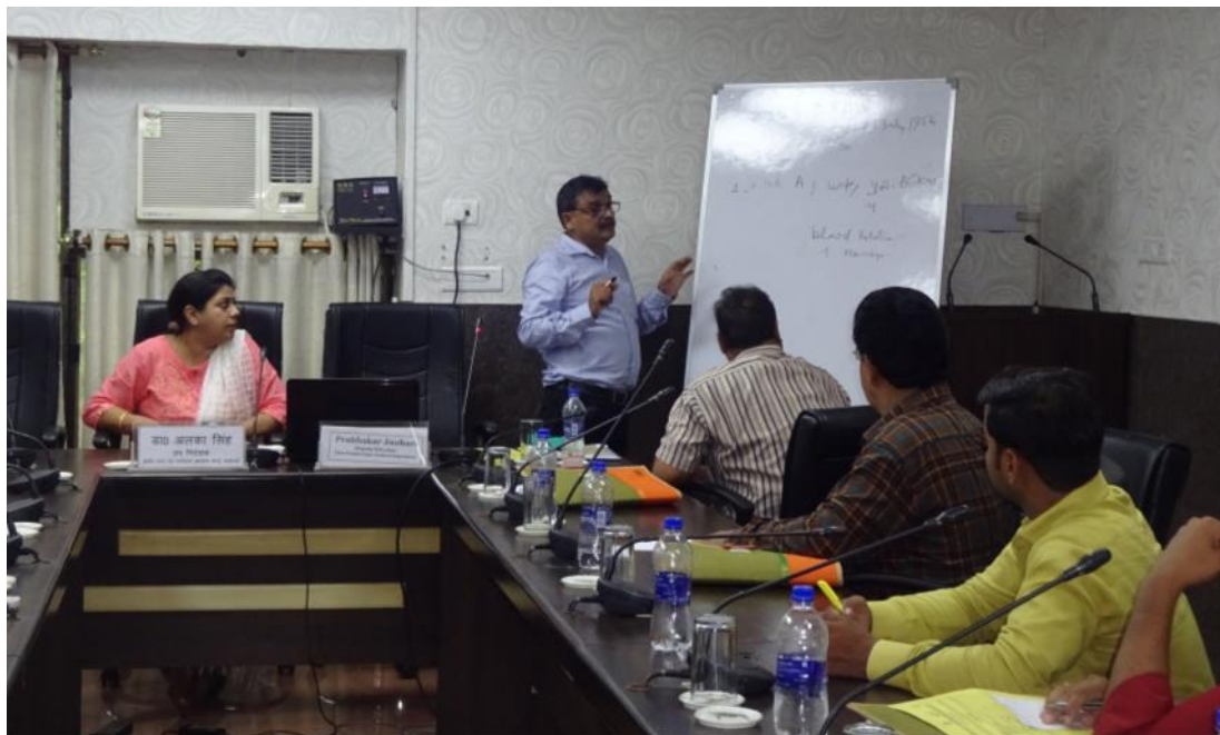
Participants during the training sessions

elected representatives, administrators, investors, creditors, executives, legislatures, State Audit Departments, and State Urban Development in a timely and organised manner. Regional Centre for Urban and Environmental Studies, Lucknow organised a three days Training Programme on Office Management, Computer Skills and Accounting (Capsule II) under AMRUT at RCUES, Lucknow on 15-17 July 2019.