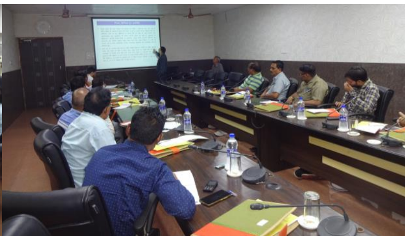
Participants during the training session