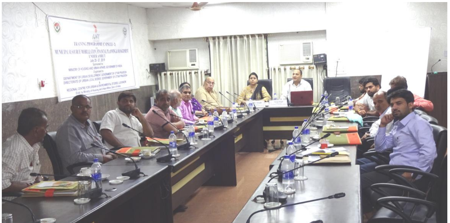
Participants during the sessions

support. They should effectively exploit the revenue potential through rationalization of assessment norms, simplification of procedures; rebate on timely payment, revision of old levies and taxes etc. Municipal governments may be allowed to enjoy fiscal autonomy with freedom of choice in regard to imposing new taxes and revising tax rates. It is argued that municipal bodies are not financially strong enough to tap capital market for undertaking infrastructure works which involve huge capital investment, long gestation period. But the provision of marketing borrowing will certainly motivate the municipal bodies to revamp their financial strength to mobilize resources from market. There is also need to encourage private sector involvement in the development, strengthening and creator of urban infrastructure. Regional Centre for Urban and Environmental Studies, Lucknow organised two, three days Training Programme on Municipal Resource Mobilization, Financial Planning and