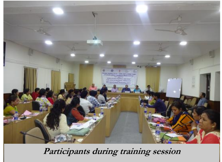
Participants during training session

provisions of Smart City Mission, AMRUT, Prime Minister Housing for All, Swachh Bharat Mission;