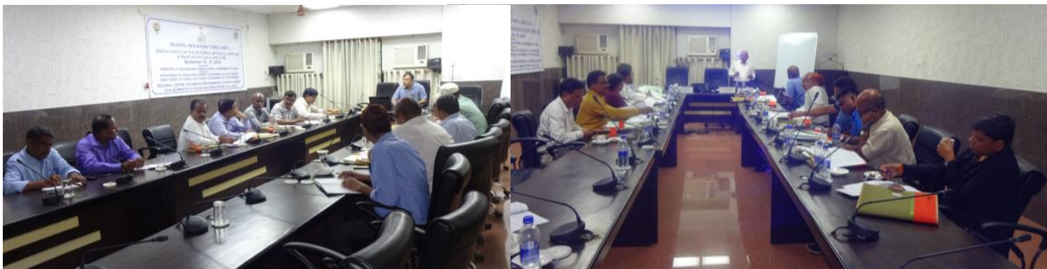
Participants during the sessions

The programme focused on water supply, sewerage, septage and drainage issues in implementation of urban infrastructure projects; service level benchmarks in water supply and current service levels in AMRUT cities; service level benchmarks in sewerage & drainage and