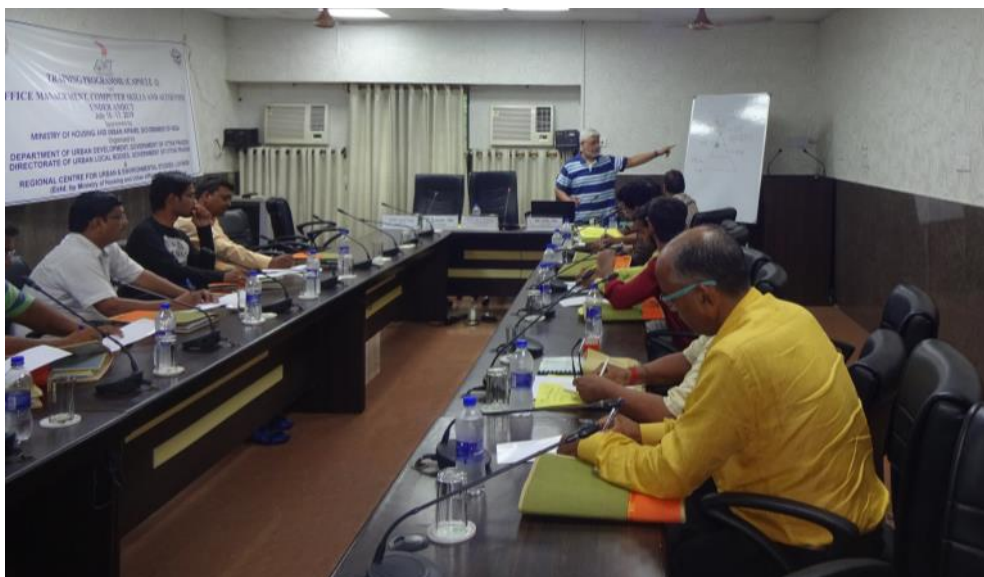
Participants during the training sessions

will address the issue of spending the funds available judiciously, an appropriate accounting system for recording the transactions, including the establishment of a proper system for asset and liabilities accounting and revenue recognition are necessary. Accounting reforms and change to an accrual accounting system is a vital ingredient in this process. The accounting reform is intended to provide financial information to various users such as, citizens,