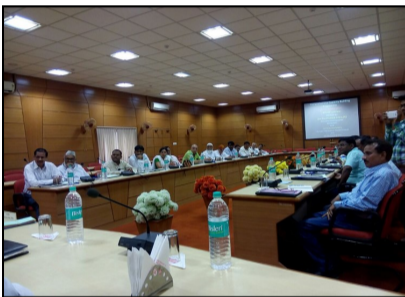
Participants during the training programme

The Center organized 13, two day training programme on Transparency in Local Governance: RTI, Public Disclosure Law & Community Participation Law. The main objectives of the Training Programme were: to apprise participants with the concepts of RTI and its guiding principles; to acquaint them on the principle provisions of the RTI Act 2005; to create awareness regarding public disclosure law and community participation law; to inform about the best practices in relation to RTI Act 2005; to provide guidance on preparation of a collective action plan for effective implementation of RTI Act; to discuss the various challenges for effective implementation of RTI Act and their possible solutions.