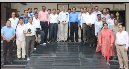
Participants during the exposure visit to Ahmedabad, Gujarat