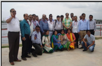
Participants at Amberpet STP

The Regional Centre organized a three day exposure visit on "E-Governance, Good Urban Governance and Solid Waste Management" from 7 th July to 9 th July 2015 for officials of Urban Local Bodies, Uttar Pradesh under Comprehensive Capacity Building Programme (CCBP). The main objectives of the exposure visit were: to discuss the initiatives being taken by the state government of Telangana on E-Governance, Good Urban Governance and Solid Waste Management; to see the best practices of Telangana State on E-Governance, Good Urban Governance and Solid Waste Management. The visit included a total of 22 delegates including Executive Officers, Engineers, Food & Sanitary Inspectors and other officers of ULB's of U.P.. All the participants were grouped in three categories mentioned below. The participants were first given theoretical knowledge followed by field visit on different subjects like Solid Waste Management Project in PPP Mode by Ramkay Enviro Engineers Limited (REEL), E-governance & Good governance initiatives at Greater Hyderabad Municipal Corporation, Sewerage Treatment Plant at Amberpet, Mee Sewa Kendra, etc. The programme was coordinated by Dr. Rajeev Narayan, Dy. Director and Dr. Nasruddin, Asst. Director, RCUES, Lucknow with active supported by Mr. Sudaksh Pandey, M & E Expert.