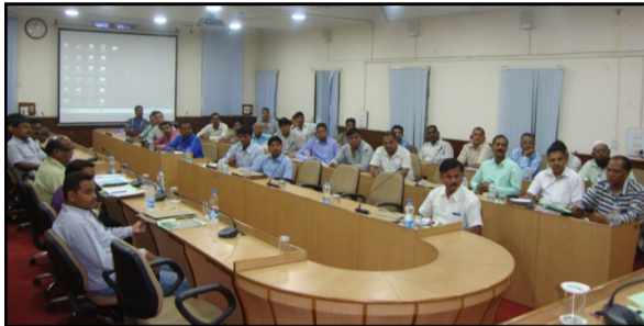
Participants during a session on Solid Waste Management

The Centre organized two, two days training programme on Management of Solid Waste in Urban Local Bodies. The main objectives of the training was to enhance knowledge of municipal functionaries about concepts and guiding principles of municipal solid waste management, to familiarize the participants with technical aspects of Collection, Segregation, Transportation, Processing, Treatment and disposal of municipal solid waste, to acquaint the participants with various techniques and tools for effective planning and management of municipal solid waste, to highlight efficient and cost effective methods of managing