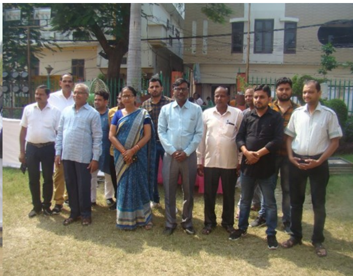
Participants during the exposure visit

also taken to a Bio Gas Digester Plant which is an innovative model of the state government for generating gas through treatment of animal shelter waste along with liquid waste at Kanha Upvan, Lucknow.