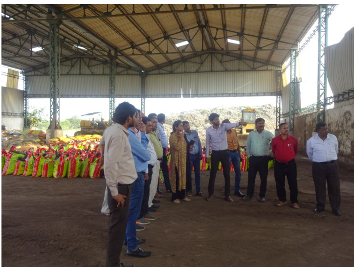
Participants during site visit