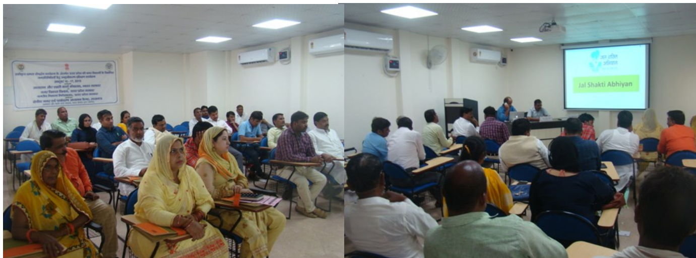
Participants during the training session

During the Orientation Training Programmes the elected representatives were made aware of decentralized governance system, emerging problems and challenges in urban governance due to rapid urbanization and functioning of urban governments. The session covered needs of basic urban infrastructure creation that has a direct link to provision of better services to people like water supply, sewerage, drainage, urban transport and green spaces/parks with specific focus on the Atal Mission for Rejuvenation and Urban Transformation (AMRUT) emphasis on mission coverage, components, programme management structure,