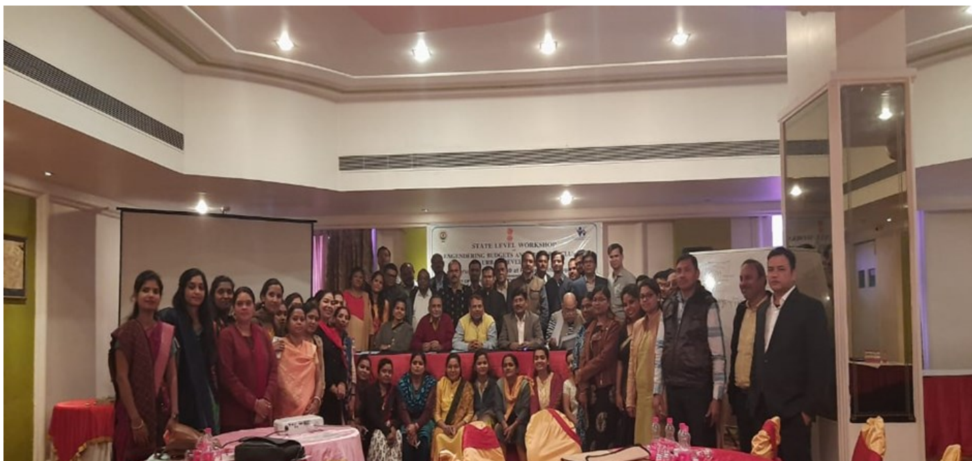
Participants of the programme