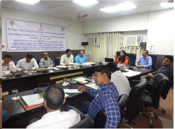
Participants during training session

The main aim of the orientation workshop is to sensitize the participants of various programmes/missions and identifying the key areas for capacity building under the Capacity Building for Urban Development Project through Training Needs Assessment.