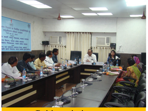
Training session in progress

the Participants during field visit to Kanha Upvan in mode