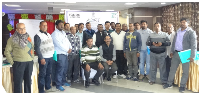
Participants at the training session at Ranchi