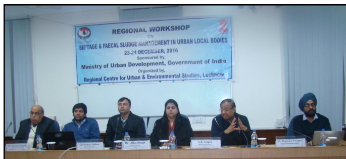
Panel discussion on establishing proper Fecal Sludge and Septage Management in ULBs

The Ministry of Urban Development, Government of India implemented Swachh Bharat Mission (SBM) with a goal to make the country clean and open defecation free, and realizes the need for establishing proper Fecal Sludge and Septage Management (FSSM). In this context, a two day Regional Workshop on Fecal Sludge and Septage Management (FSSM) was organized by RCUES Lucknow on 23-24 December 2016 for municipal functionaries of different states. The main objectives of the workshop were to highlight the various issues and challenges related to FSSM, to discuss various technologies & practices in FSM, to discuss the initiatives taken by different State Governments. The workshop provided a platform for cross learning and moving ahead for effective implementation of FSSM in cities. The experts deliberated on the structuring of FSM Projects and their financing methodologies. The sessions were a mix of theoretical knowledge and a sneak-peek into the ground reality through Case Studies. Along with the internal faculties experts from CEPT Ahmedabad, Infrastructure Development Corporation Karnataka Limited (iDeCK), Water Aid India and Consortium for DEWATS Dissemination Society Bengaluru, also took extensive sessions on various facets of FSSM. In all 42 participants from ULBs which included Junior Engineers, Executive Officers and officials from PHE department attended the programme. Workshop was coordinated by Dr. Alka Singh, Deputy Director, RCUES Lucknow.