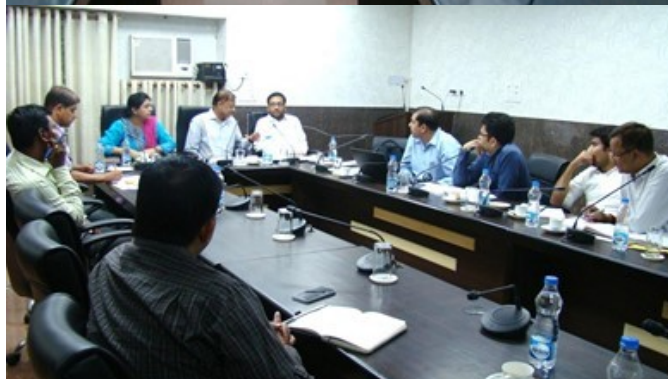
Handholding Workshop under Smart Cities Mission