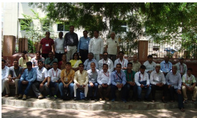
Participants during the field visit along with local Community Representatives and RCUES Lucknow faculty members

A one day workshop on Swachh Bharat Mission on 6 th December 2016 for officials of Urban Local Bodies, Uttar Pradesh. The main objectives of the workshop were: to acquaint the participants with the need, Importance and objectives of Swachh Bharat Mission; to aware the participants with the need, importance and role of Solid Waste Management in Swacch Bharat Mission; to aware the participants with the need, importance and role of PPP and IEC in SBM. The workshop was followed by a three day exposure visit to Hyderabad from 7 th to 9 th December 2016. The main objectives of the exposure visit were: to discuss the initiatives being taken by the state government of Telangana on Swachh Bharat Mission and Solid Waste Management; to see the best practices of Telangana State on Swachh Bharat Mission and Solid Waste Management. The participants were provided theoretical knowledge and exposure through lecture–cum –discussion and field visit on different sites like Solid Waste Management Project in PPP Mode by Ramkay Enviro Engineers Limited (REEL), Methodist & Ambience Colony of Hyderabad on maintenance of SWM, Parks, Rain Water Harvesting by the community on PPP Mode. In total 21 participants were nominated for both workshop and the exposure visit comprising of various categories like Engineers, Food & Sanitary Inspectors and other officers of ULBs of U.P. The programmes were coordinated by Dr. Rajeev Narayan, Course Director and Dr. Nasruddin, Co-Course Director, RCUES, Lucknow.