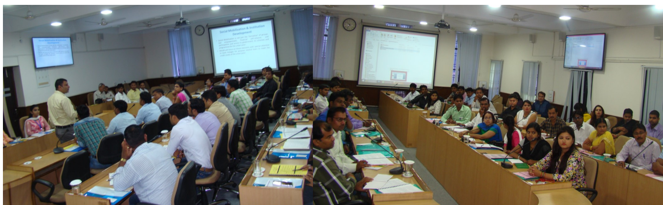
NULM training sessions in progress