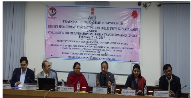
Panel discussion during the training sessions

The Regional Centre for Urban Environmental Studies, Lucknow has been organising series of capacity building programmes under AMRUT, in this series a three days training programme was organized on 2 nd -4 th February 2017 on Project Management, Contracting and Public Private Partnership as part of the advanced training Capsule II for Municipal Functionaries of Chandigarh Municipal Corporation. This Training focused on Project Management, Contracting and PPP. This course was instrumental in the capacity building of ULB executives it facilitated participants to enhance their technical knowledge regarding project structuring, effective implementation of infrastructure projects, management of PPP project, different procurement strategies, methods and approaches used in a variety of infrastructure projects, to develop skills that facilitate project structuring; especially the structuring of complex Public Private Partnerships, and designing procurement documents, tender documents, bid process management including evaluation, pre-bid meetings, contract closure and post-closure management. 24 senior officials and Engineers from Municipal Corporation Chandigarh attended the above training programme. The objectives of the training were to provide appropriate skills regarding