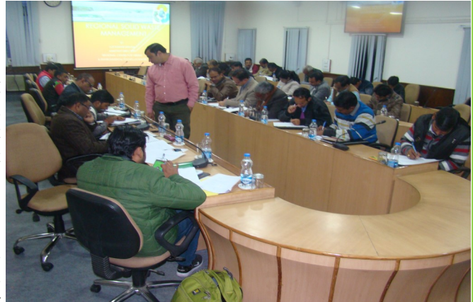
Participants during the activity session of the training programme on Solid Waste Management

The Center organized two day Regional Training programme on Improving Service Delivery in Urban Local Bodies on 10th-11th January 2017 at Lucknow. In all 29 participants including Assistant Engineers, Junior Engineers, Tax Superintendent, Sanitary and Food Inspectors of Urban Local Bodies attended the programme. The training focused on various approaches and methods of demand assessment & estimation of Water Quality and Quantity; design standards and specifications for water supply schemes; to review the status of Water Treatment Plants and its Operations and Maintenance; the Design Criteria of Sewerage Projects. The experts deliberated upon the concepts, need, relevance and process of service level benchmarking; they highlighted the relevance and procedures of benchmarks in urban water supply, sewerage, sanitation and storm water drainage; Performance Improvement Plan and Performance Assessment System. During the training the problems and challenges in achieving service level benchmarking were discussed at length and a road map for improving sanitation and environmental services in urban centres was suggested. The programme was coordinated by Mr. Ajit Kumar Mishra, RCUES Lucknow.