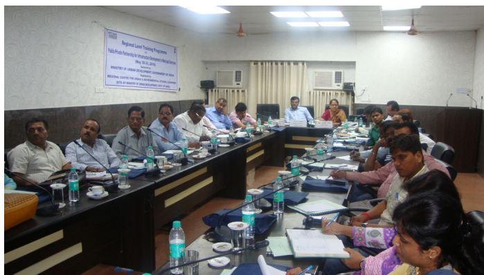
Training session in progress

The programme was attended by 38 senior officers including Executive Officer, Assistant