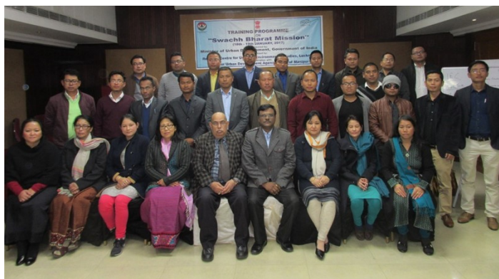
Participants along with the faculty members at the training programme