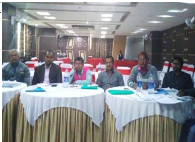
Training Session in progress