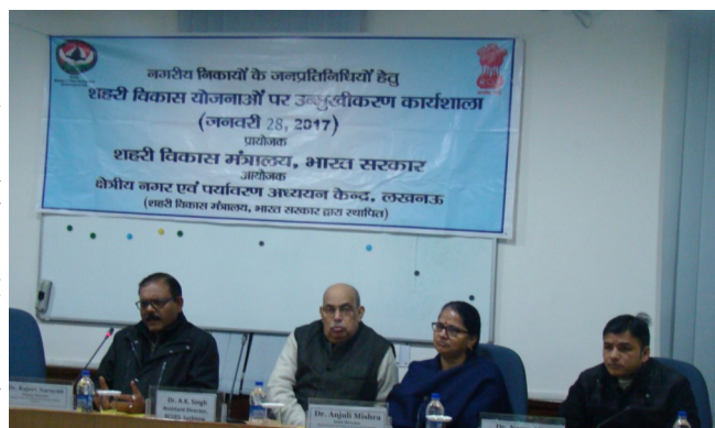
Panel discussion during the training sessions