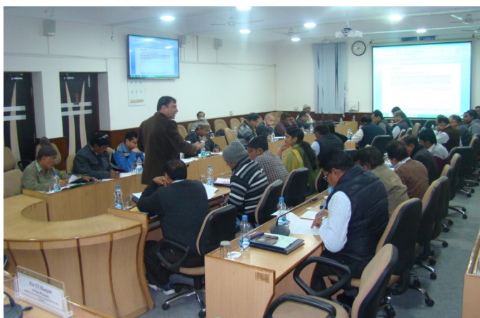
Training Session in progress

The Regional Centre organized two three day Specialized Training Programme (2 nd Capsule) under AMRUT for the officials of Engineering wing of Uttar Pradesh, at Lucknow on 5 th –7 th December 2016. The main objectives of the programme were to prepare the participants for implementing service level benchmarks in water supply, Sewerage and drainage and their current service levels in AMRUT Cities; to discuss about the approaches and methods for demand assessment and estimation of water quantity and quality; to detail out the design standards and specifications for water supply schemes, O&M related to water treatment plants. The sessions included practical exercises to help participants in identification of projects under AMRUT, framing of Service Level Improvement Plans related to water supply, sewerage and drainage.