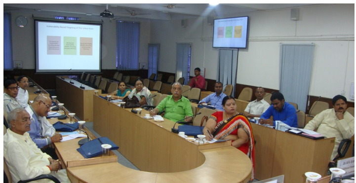
Elected Representatives of ULBs during the training session on Urban Development Schemes

Elected Representatives have a major role to play in ensuring effective implementation of the national and state level mission. To ensure their participation & cooperation with other municipal functionaries a One-Day Orientation Workshop on Urban Development Schemes was organized for Elected Representatives on July 4, 2016 and on September 28, 2016 at Lucknow. The main objectives of the programmes were to acquaint the Elected Representatives with the need, importance and implementation strategy of various national level schemes viz. AMRUT Mission, Swachh Bharat Mission, National Urban Livelihood Mission and Housing For All; The programme also focused on the initiatives for Reforms implementation at the state and ULB levels.