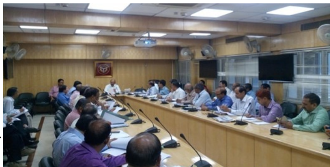
SHPSC Meeting for approval of AMRUT DPRs