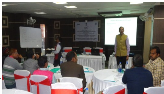
Training session in progress

Development, Government of Jharkhand on March 6-8, 2017. The main objective of the programme was to discuss and deliberate on issues of tendering and contract management, financial planning and municipal resource mobilisation. The course contents included contract laws and guidelines, types of contracts, statutory duties, TDS, VAT, CST, service tax, ESI, EPF, deduction, e-return filling, tax audit, contract management, Bid process, risk management in contract, evaluation of technical and price proposals, bids and awarding of contract, GST and its impact on project, land value capture finance, municipal resource mobilization etc. The programme was attended by 36 participants mainly Tax Collectors and other officials of accounts and finance department from ULBs of Jharkhand state.