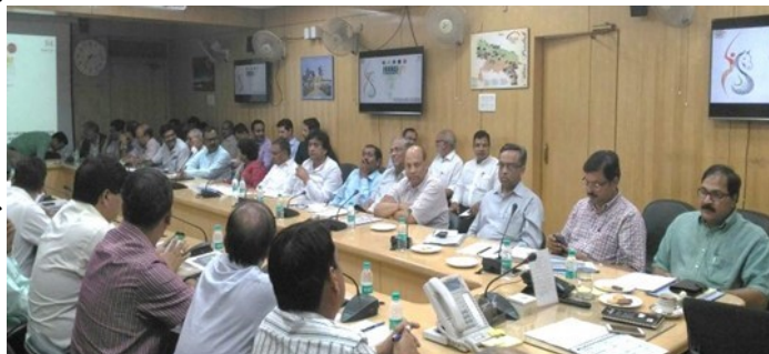
SHPSC Meeting for approval of Smart City Proposals of Uttar Pradesh