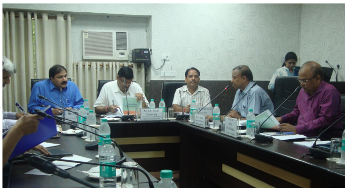
Advisory Board Meeting in progress