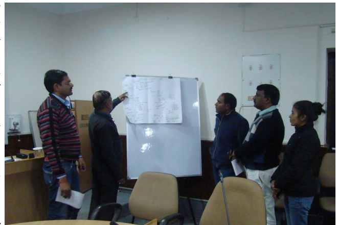
Participants during group activity session