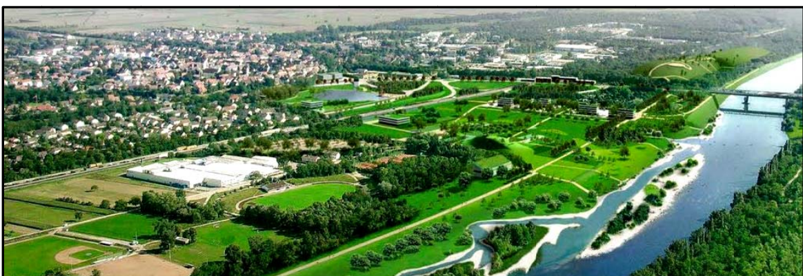
Fig. 5.2: Panoramic View of planned Urban Greens