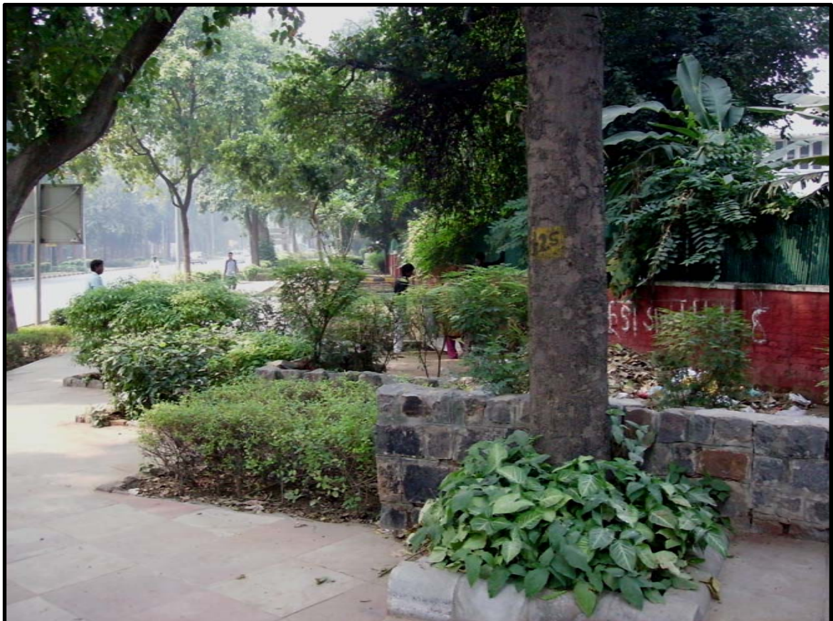
Fig. 8.4: Mixed Plantation