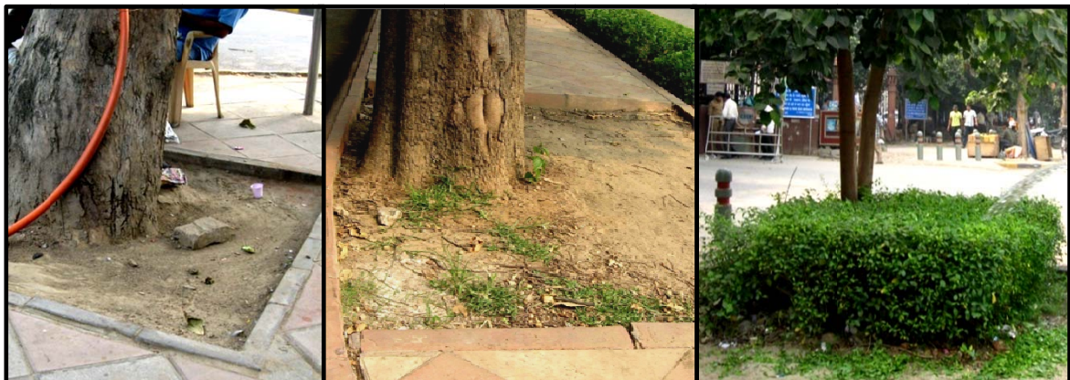
Fig. 7.2: Desirable root pits around trees

It has been observed that many trees and tree branches have fallen in various cities owing to heavy rain and wind. Strong winds apart, concretisation of pavements has much to do with the falling of trees. Many of the trees are those planted on roadsides as well as on central verges. Over the years, the open area around them has shrunk, having been paved or cemented. This means the roots do not have enough room to spread or grow strong enough. There is no space for new roots to form either. Other weakening factor of roadside trees – regular pruning of branches to make way for overhead utilities, often lopsided due to height, they lose strength to withstand strong winds.