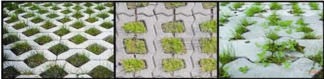
Fig. 9.1: Perforated tiling for pavements

Unnecessary and excessive tiling of the roadside pavements should be avoided. The area around trees should not be covered with tiling as it hampers the basic necessary functions and needs of the trees. In addition root aeration and availability of water gets drastically reduced. Whatever tiling is done, pervious tiles should be used. Roots of the trees should be protected, top soil should be preserved while taking up civic works. Indiscriminate tiling of road dividers and foot paths should be avoided.