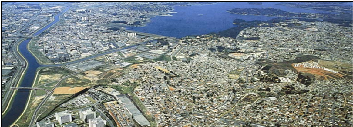
Fig. 5.1: Panoramic View of Urban Sprawl

Tokyo suffers from a shortfall of open space which averages 6.1 to 8.5 sqm per capita, but it has a large forest of 21,630 Ha to conserve water.