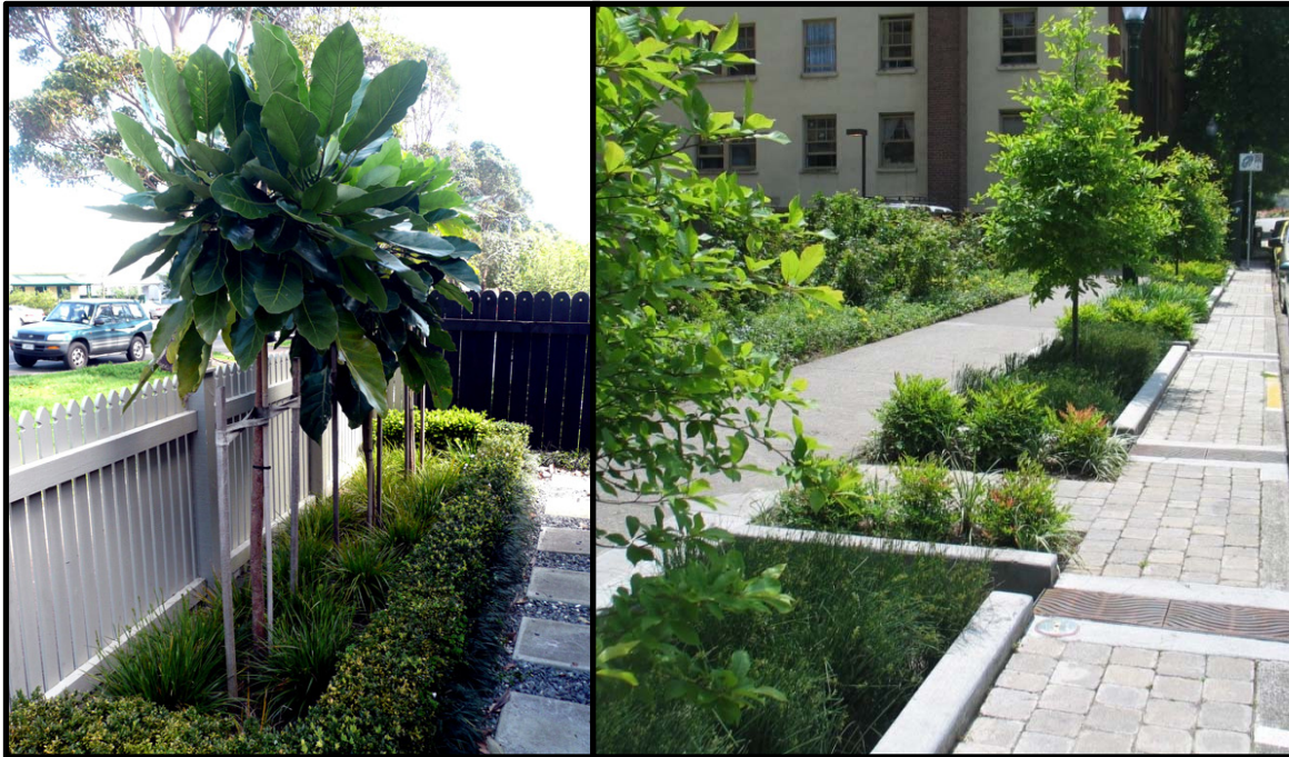
Fig. 8.5: Informal Plantation

In urban fringe settings, avenue planting may include formal landscape on an otherwise informal one. Single trees may be featured where practicable, providing visual interest.