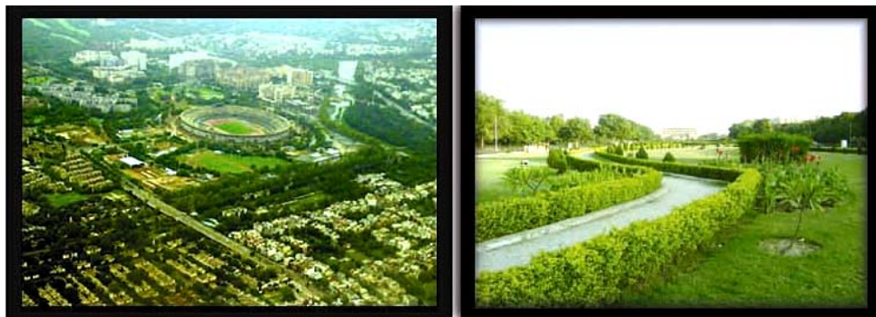
Fig. 1.0: General Illustrations of Urban Greens

Realizing the importance of maintaining and preserving urban greens, it is imperative to prepare Urban Greening Guidelines which will act as a model for States and Cities particularly the State Town Planning Departments, Urban Development Authorities and Urban Local Bodies who are responsible for managing them.