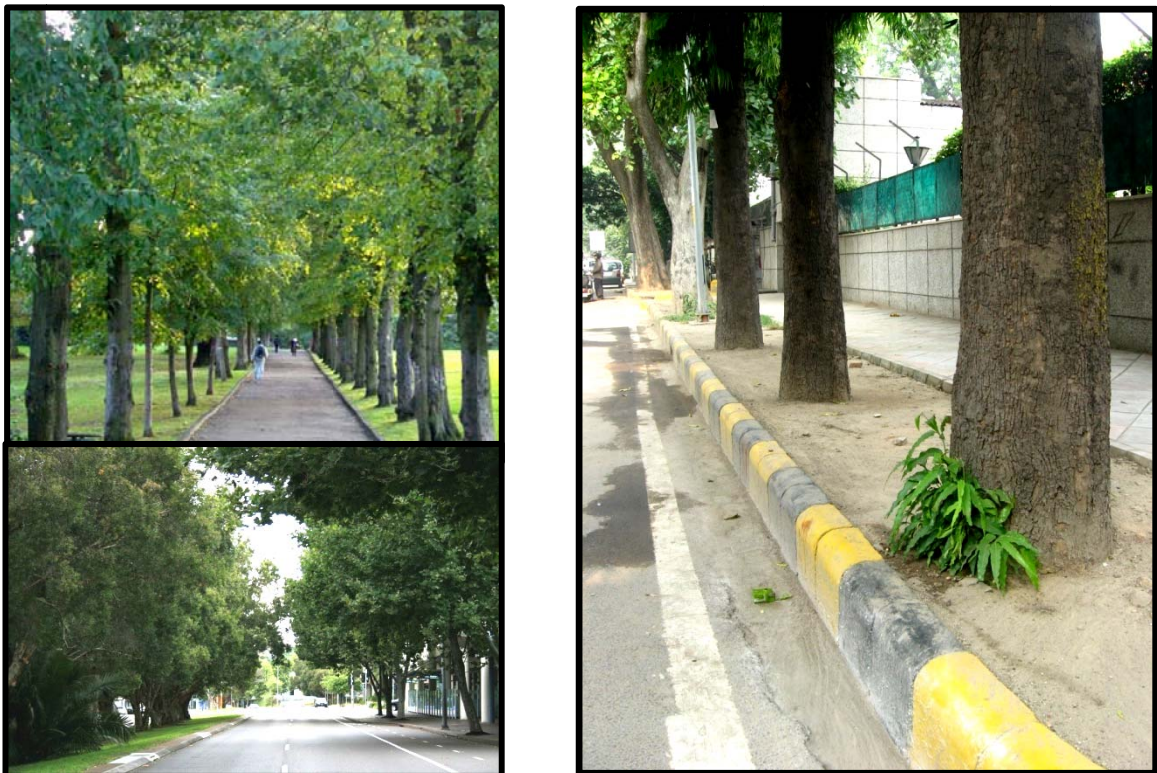
Fig. 8.2: Avenue Plantation

Avenue planting consists of planting areas in single or double rows along highways. Long avenues may become monotonous and where travel speeds are high, may induce drowsiness. Loss or irregular growth of individual tree in long avenues is also noticed. These disadvantages may be overcome by planting at irregular intervals of say 30-75 metres and by off-setting the trees by 1 to 1.5 m from a uniform alignment. Avenue planting will take a distinct form of treatment on curves and undulating contours. In large cities and locations, where, land is available double avenues of trees may be provided. On divided carriageway having separate pedestrian footpath, the outer rows consisting of shady trees and inner row consisting of ornamental flowering trees may be adopted.