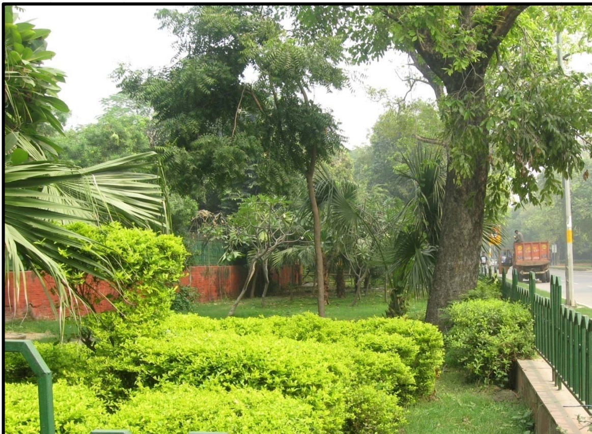
Fig. 8.3: Group Plantation