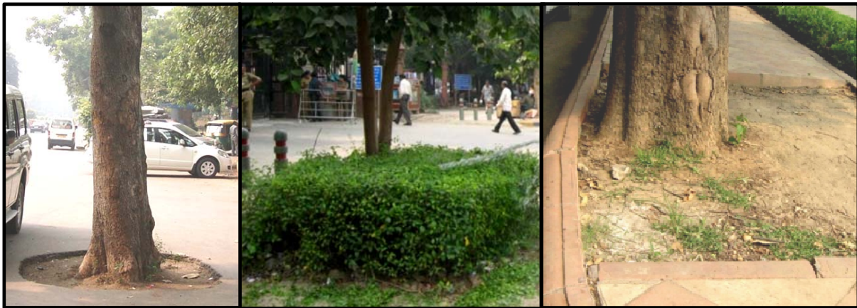
Fig. 9.2: Desirable Space around tree roots

A minimum area of 1.25 m x 1.25 m around the trees should be left un-cemented, widening of roads upto the trunk of trees is to be avoided as roots come under the asphalted roads which will gradually die. In case of storm, these trees may topple. Activities which adversely affect the roots are to be minimized.