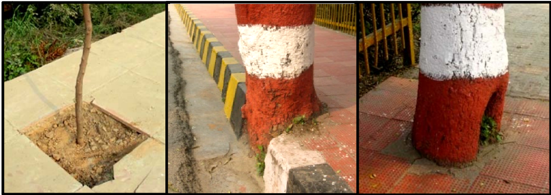
Fig. 7.1: Impermeable Tiling around trees

There is a keen competition for space in urban areas. Trees are often found growing in tree pits or planters surrounded with concrete in a paved area, with solid paving very close to the tree trunks. These trees often suffer from severely restricted growing space and the lack of air and water under impermeable surfaces. In some cases, tree roots grow vigorously and even damage the pavement. While in other situations, roots may be cut off or damaged during pavement repair work.